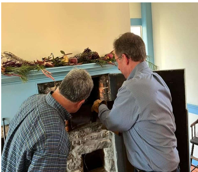
Using the Beehive oven

It was great to get this event back on track, as we had two cancel it the past two years due to the pandemic.