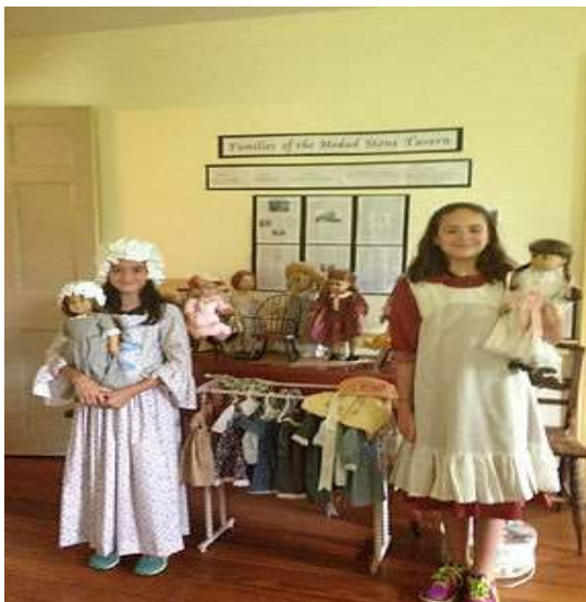
American Girl Doll Camp

Cost for each camp is $125 and includes project materials. Email info@guilfordkeepingsociety.com or call 203-453-2263 to enroll.