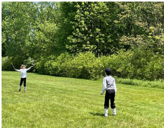
Fun and Games at Early Guilford Days

During 2020 Virtual Learning activities and videos were put on the Hyland House and the Guilford Keeping Society web pages. The children were able to experience Early Guilford Days virtually rather than in person. In 2021 and 2022 Early Guilford Days were done at the schools. Using both the online materials and a day of activities at the schools, the students learned about early life in Guilford.