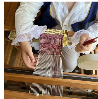
Weaving at Early Guilford Days

Thanks to generous donations from the Guilford Preservation Alliance, and the four elementary school PTO's. funds are provided to do Early Guilford Days.