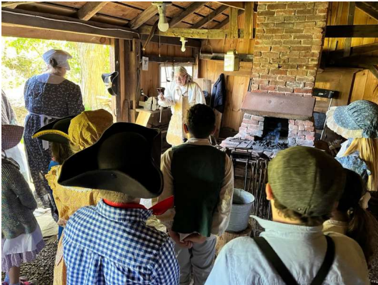
Blacksmith Shop at the Thomas Griswold House